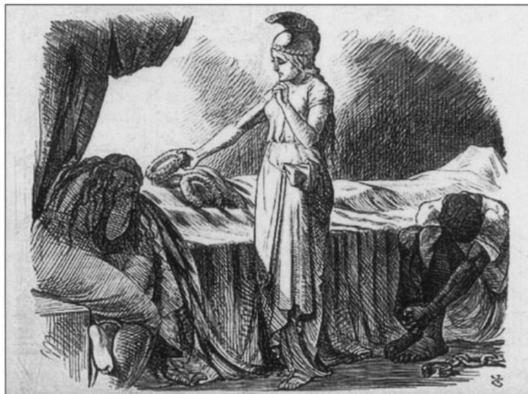
In May 1865, a very different image of Lincoln appeared in Punch . Here, Britannia gently and respectfully lays a wreath on Lincoln's deathbed, while a freed slave weeps in the lower right corner of the illustration.

The destruction of American slavery, a growing system of bondage of nearly four million people in one of the world's most powerful economies and most dynamic nation-states, was a consequence of world importance. Nowhere else besides Haiti did slavery end so suddenly, so completely, and with so little compensation for former slaveholders (14). Had the United States failed to end slavery in the 1860s the world would have felt the difference. An independent Confederate States of America would certainly have